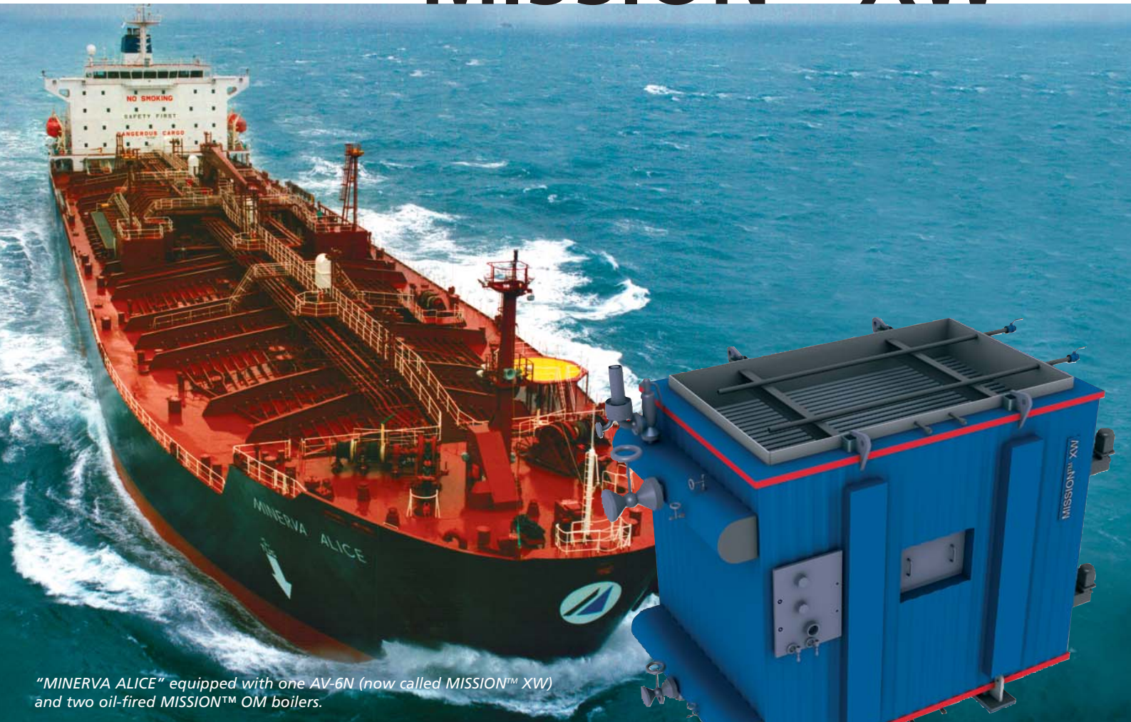
"MINERVA ALICE" equipped with one AV-6N (now called MISSION™ XW) and two oil-fired MISSION™ OM boilers.