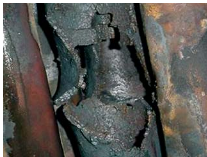
Tube burst due to short-term overheating