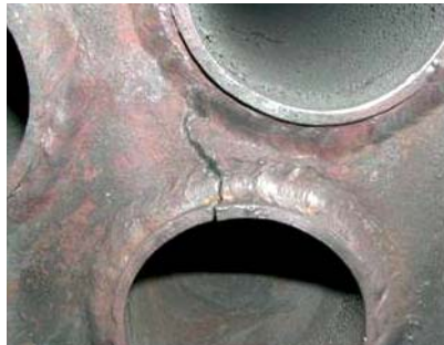
Creep cracks in a boiler end plate due to long-term overheating

While a short but severe overheating causes considerable deformation of the tube, a long-term overheating often causes less deformation limited to a minor area around the crack. A metallurgical examination of the material in the vicinity of the crack shows clear signs of creeping with development of voids in the grain boundaries and several parallel cracks.