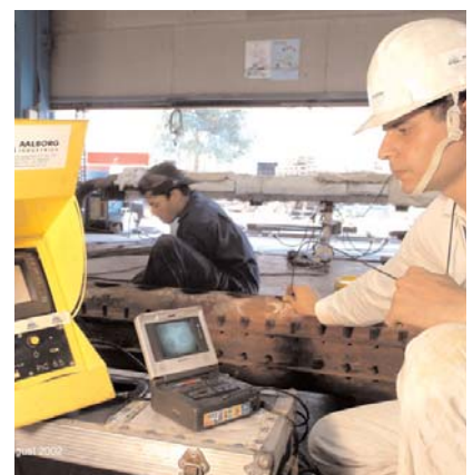
Examination of boiler by means of fibroscope to check for cracks.

Furthermore, cracks can be prevented by observing that the permissible stress levels for boiler construction are not exceeded. This can be avoided by following the instructed firing up procedures and load change limitations of the individual boiler.