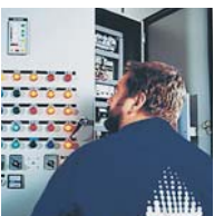
Aalborg Industries can service all types of control panels.