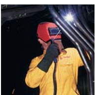
Always experienced, certified welders from Aalborg Industries.