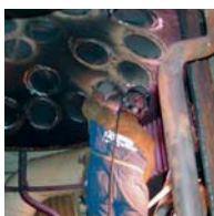
Installation of OEM manufactured pin tubes.