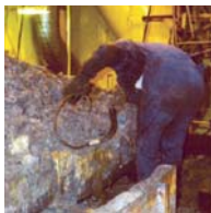
When worst comes to worst, Aalborg Industries is close by.