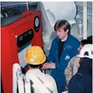
After commissioning, our service engineers train the ship's crews.