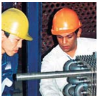
New boilers and components come in ISO 9001 certified quality.