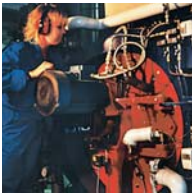
For chief engineers, easy burner operation and maintenance is vital.