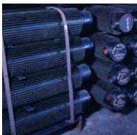
Aalborg Industries designs, manufactures and stocks pin tubes.